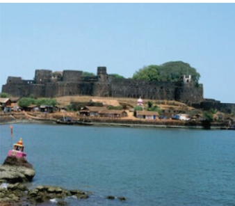
Jaigad & Vijaydag 31 kms