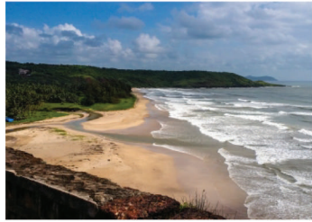
Aare-Ware Beach - 6 kms