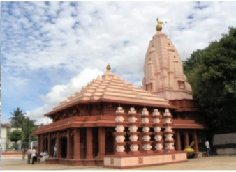
Ganapatipule 9 kms