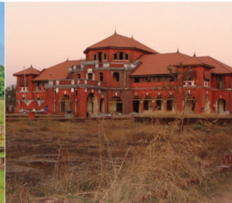
Thiba Palace 20 kms Ratnagiri