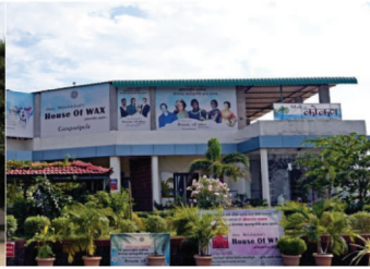
Wax Museum 9 kms Ganapatipule