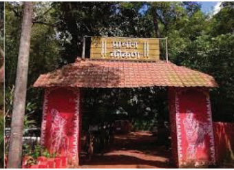
Prachin Kokan 10 kms Ganapatipule