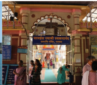
Pawas 35 kms