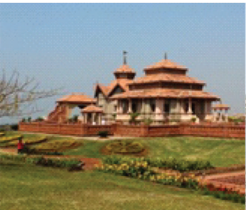
Jai Vinayak Temple 23 kms