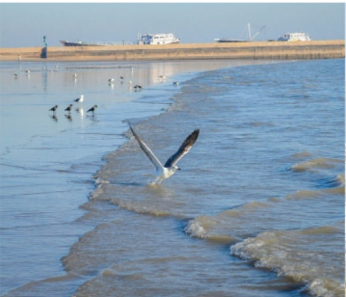
Mandvi Beach 19 kms