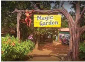
Magic Garden 10 kms Ganapatipule