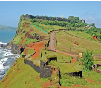
Ratnadurga 20 kms